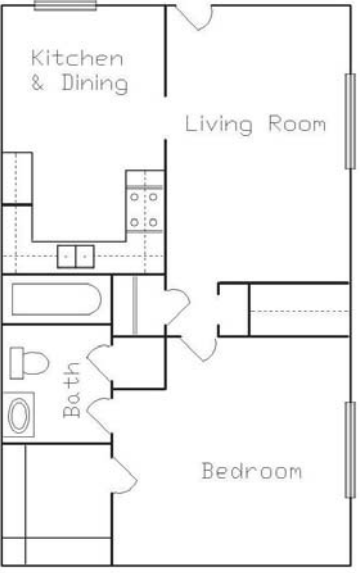
1 Bedroom / 1 Bath 646 Square Feet $415 - $430 per month $125 security deposit